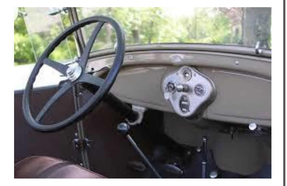
1928-9 Splined, used with 7 tooth steering box