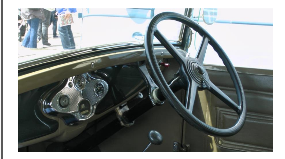
1930-31 Keyed used with 3 tooth steering box